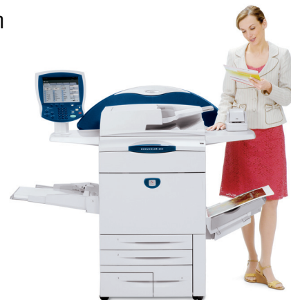
Document Centre 240

Xerox DocuColor multifunction printer and Mapping Fastbind bookbinding system