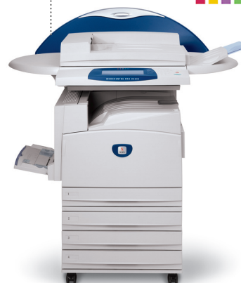
WorkCentre Pro C2636